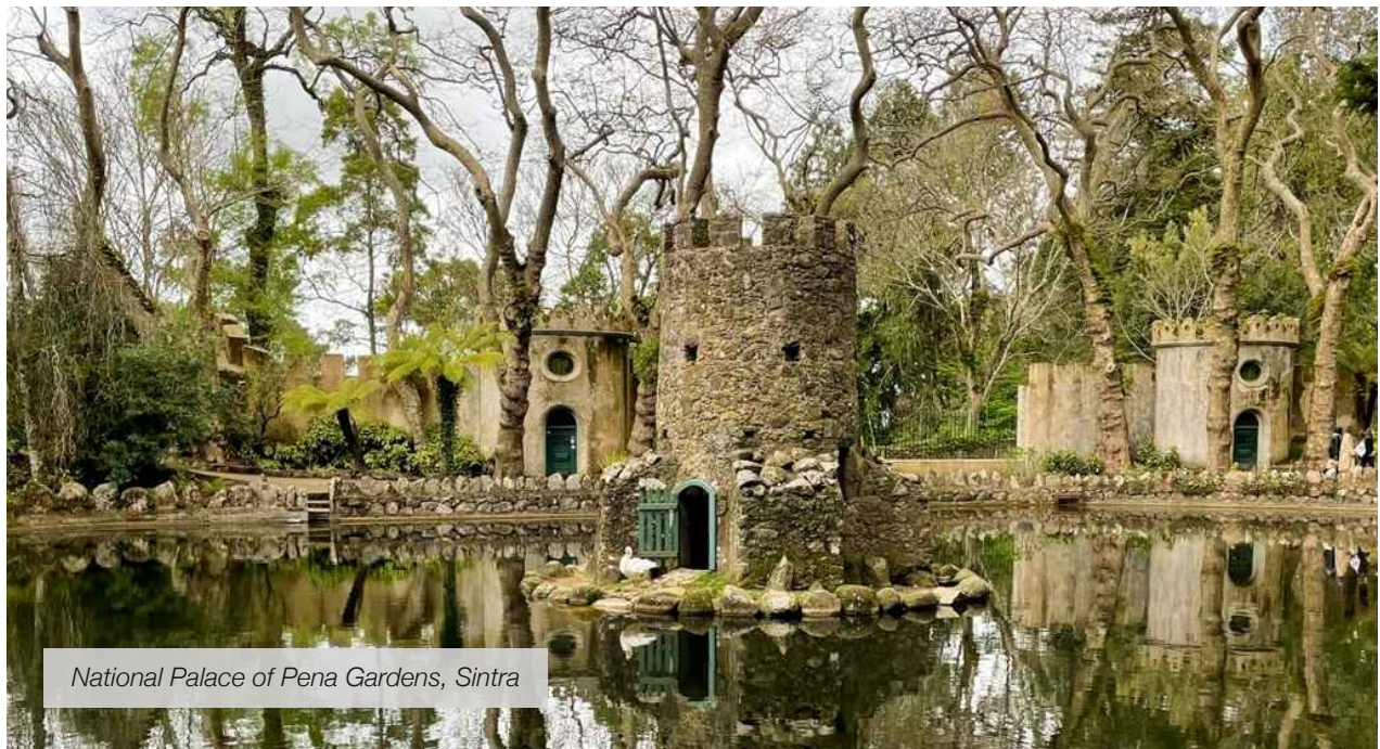
National Palace of Pena Gardens, Sintra